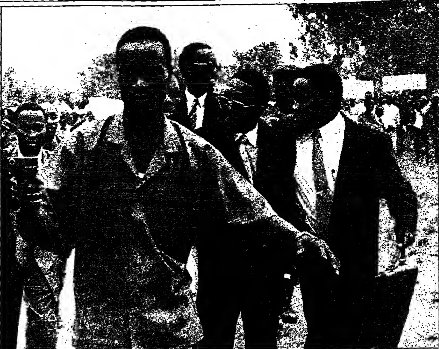
Burundian President Sylvestre Ntibantunganya (with glasses) is rushed away by his bodyguards after being stoned by angry Tutsis attending the mass funeral for the 340 civilians killed in a massacre by Hutu rebels at the weekend. Ntibantunganya has taken refuge in the US Embassy.